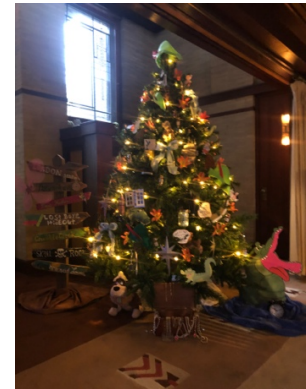
3. Library Tree

Publicity was in State Journal Register, Illinois Times, Senior News, Dana Thomas House Foundation Newsletter, SCGC Announcements and Websites-Dana Thomas House, DTH Foundation and SCGC.