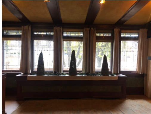
2. Susan's Mom's Bedroom