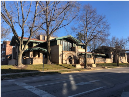
1. Dana Thomas House

Workshops were held to create ornaments for the J.M.Barrie (An Author during Dana's time) inspired Peter Pan Tree in the Library and to paint natural materials.