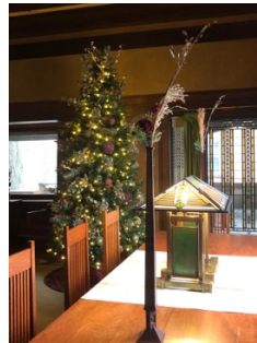
2. Living Room