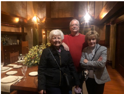
1. Touring Members & Guests