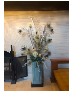
3. Reception Fireplace

We decorated in the style of Frank Lloyd Wright using 60 different natural materials , highlighting contorted filbert and hydrangea this year, by bring the outside inside, some natural materials embellished with gold paint to add sparkle and depth to our designs. 40 SCGC members worked at home prepping their designs, supplies and organizing the various components of the project and in DTH in late October and early November for a total of 720 volunteer hours . They created 90 pieces including 11 trees, 10 wreaths, 2 swags, 58 inside design pieces and 9 outside pieces .