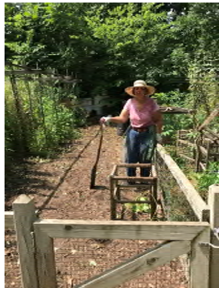
After 3 hours of weeding