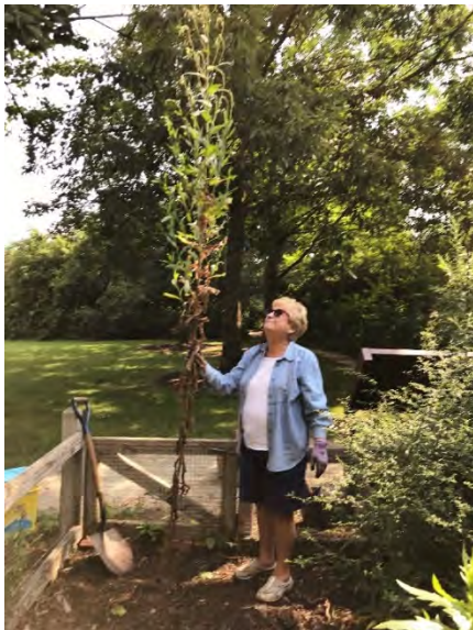
We had weeds taller than us!