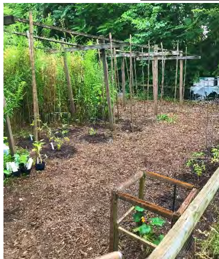
Planting Day - August 6, 2021