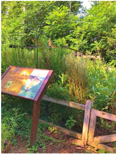
Garden Sign – July 29, 2021