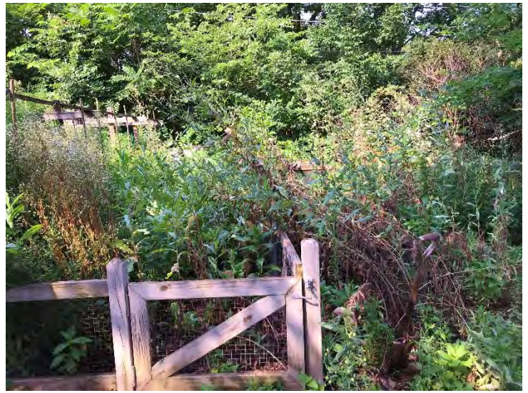
Garden Entrance – July 29, 2021